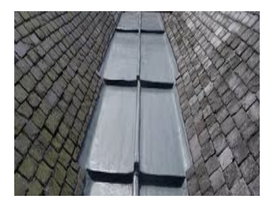
Fig 1: Traditional Stepped Detail

Recently, with modern building practices advancing, the appearance of a neoprene joint has been brought on the market which removes the step detail and allows for a shallower fall.