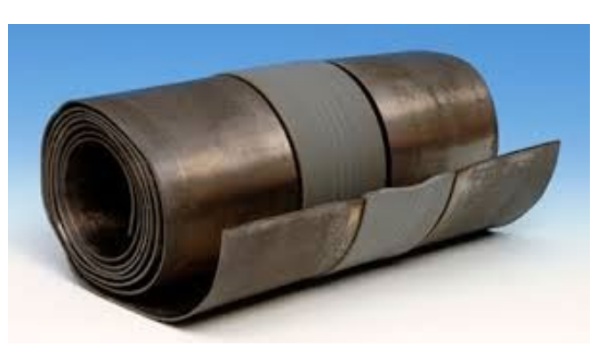
Fig 2: Neoprene Joint Lead Roll

The neoprene joints are welded to the lead sheets and then covered using clips and a capping section.